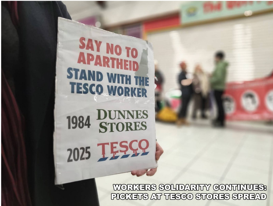
WORKERS SOLIDARITY CONTINUES: PICKETS AT TESCO STORES SPREAD

As the New Year begins, so too has the protests in solidarity with the IWW Ireland member, suspended from the Newcastle Tesco store for refusing to handle Israeli goods.