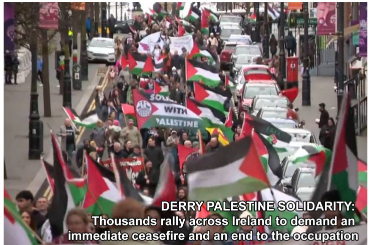
DERRY PALESTINE SOLIDARITY: Thousands rally across Ireland to demand an immediate ceasefire and an end to the occupation

A spokesperson for the Industrial Workers of the World (IWW) in a statement condemned the latest wave of Israel's bombing of Gaza. It comes as activists took part in actions in solidarity with Palestine throughout Ireland, including a sit-down protest in central Belfast which brought traffic to a standstill. "The Zionist terror regime of Israel has again without due care for humanity or the population of Gaza and with no regard for international law broken a formally agreed ceasefire, again carrying out widespread bombing throughout Gaza, slaughtering hundreds