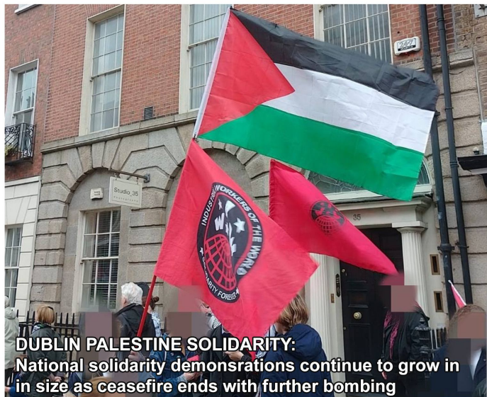
DUBLIN PALESTINE SOLIDARITY: National solidarity demonstrations continue to grow in size as ceasefire ends with further bombing

of innocent people. Prior to this decision, this same fascist regime had again completely blockaded the area of Gaza, cutting off food supplies, medical aid, fuel and water to its population, reigniting its terror policy of depopulation by conducting ethnic cleansing and collective punishment upon innocent Palestinian communities in Gaza and the West Bank.