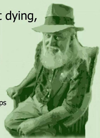
IWW Organiser & Folk Singer: Utah Phillips

"Between these two classes a struggle must go on until the workers of the world organise as a class, take possession of the means of production, abolish the wage system, and live in harmony with the Earth."