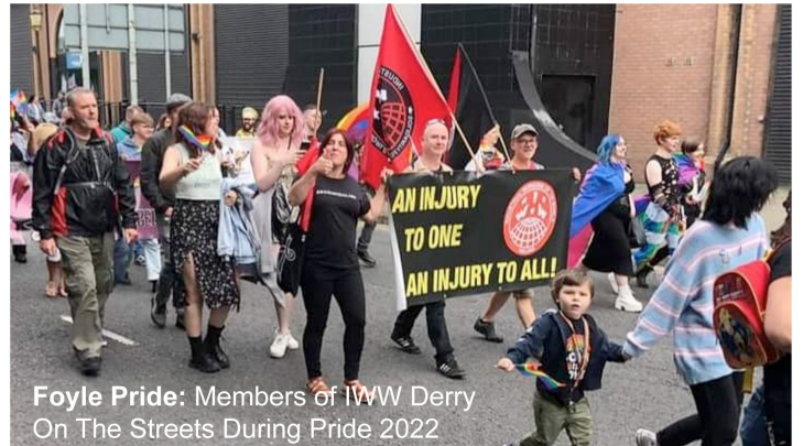
Foyle Pride: Members of IWW Derry On The Streets During Pride 2022

A spokesperson for IWW Derry Branch said that "The annual pride parade takes the route of the original Civil Rights march in Derry. The act of which itself is an important connection with the past linking the struggles of yesterday and the ongoing struggle today. As a revolutionary union, we're here to add our voice in solidarity with the LGBTQI+ community, who still face huge barriers of discrimination and attacks both within the workplace and on the streets" #FoylePride